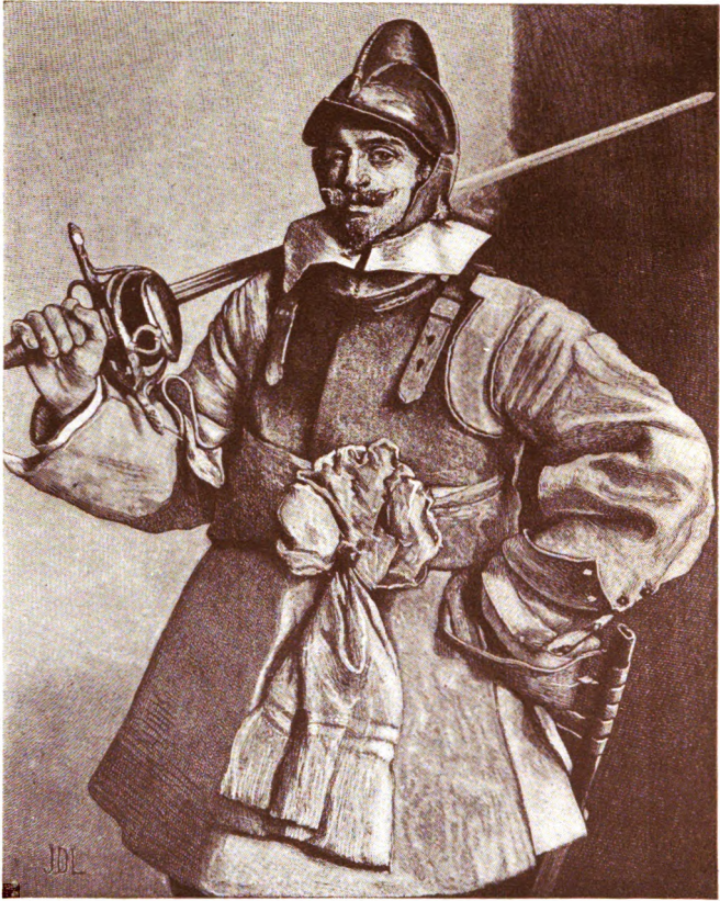
Great-heart "The Interpreter then called for a Man-Servant of his, one Great-heart" —page 214